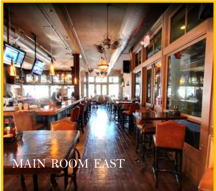
MAIN ROOM EAST