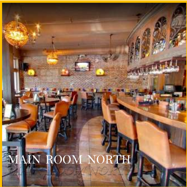
MAIN ROOM NORTH